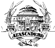
EXHIBIT A: CEQA Exemption Title 9 Zoning Ordinance Text Amendments