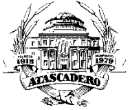
EXHIBIT A: CEQA Exemption Title 9 Zoning Ordinance Text Amendments