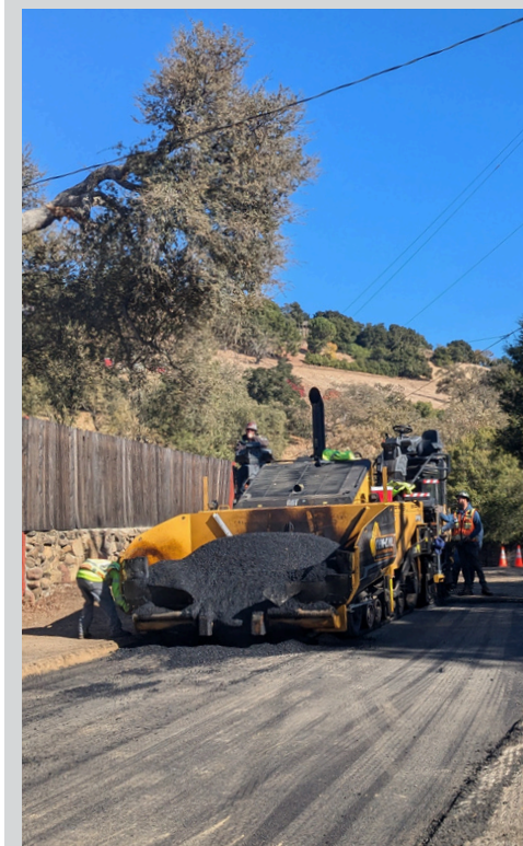
Monita Rd. Rehabilitation

Ash St. - Catalpa St. to El Camino Real Bella Vista Rd. - San Marcos Rd. to End Birch St. - Catalpa St. to End Carmelita Ave. - San Andres Ave. to Curbaril Ave. Catalpa St. - North End to San Rafael Ct. Cuesta Ct. - San Rafael Rd. to End Ensenda Ave. - Via Ave. to Capistrano Ave. Flores Rd. - Santa Lucia to Los Gatos Hermosa Ave. - Navarette Ave. to San Clemente Las Lomas Ave. - Principal Ave. to El Bordo Ave. Maple St. - Catalpa St. to El Camino Real Monita Rd. - Catalpa St. to El Camino Real Montecito Ave. - East Front St. & ECR to Las Lomas Ave. Pinewood Ct. - Catalpa St. to End San Diego Way. - ECR US 101 NB Off Ramp San Gabriel Rd. - East Front St. to El Camino Real San Rafael Ct. - West End to El Camino Real Sierra Vista Rd. - San Marcos Rd. to Monita Rd. Willow Ct. - West End to El Camino Real Via Ave. - Traffic Way to Ensenada Ave.